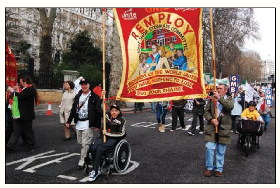
Remploy workers marching against closures34

4.16 GMB is not, and has never been, an uncritical apologist for any employer. We were not shy to draw attention to Remploy's top-heavy,